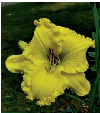
Sunshine Makes Me Smile