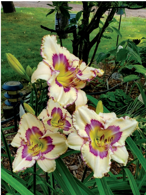
Finish The Race Effin I lava You & Kayla's Song